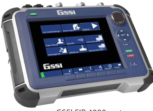
GSSI SIR 4000 system